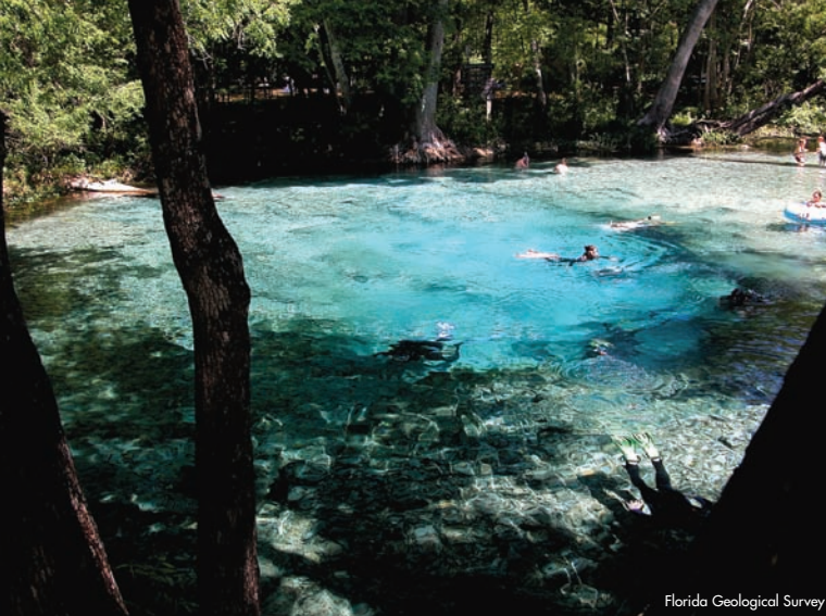
Florida Geological Survey